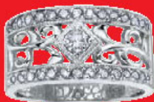
14Kt 0.50ct. DD1504 $849