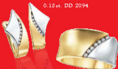
0.15ct. DD 2094