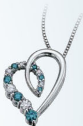
14 Kt 0.33 ct. DD 2066 $499