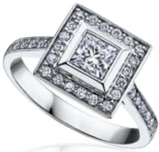
PwBk 0.50ct. DX 453 $1,199