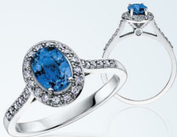
SAPPHIRE 14Kt 0.33ct. DD 2141 $999