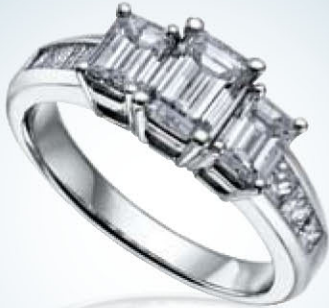
PwBk DX 371 1.00ct $2,499 2.00ct $6,999 1.50ct $4,599 3.00ct $12,999