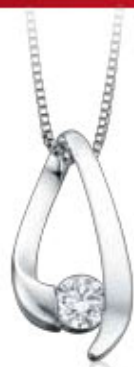
14Kt 0.20ct. DX 467 $699