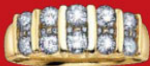
14Kt 0.50ct. DX 227 $749