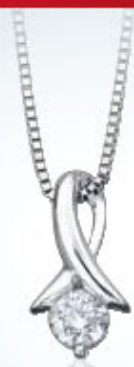
0.26ct. DD 2100 $449