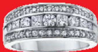
14Kt 1.00ct. DX 461 $1,499