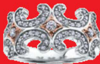
14Kt 0.50ct. DX 462 WHITE GOLD WITH ROSE GOLD ACCENTS $699