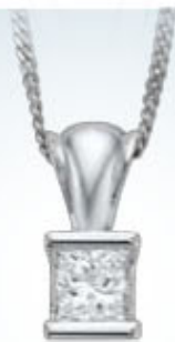
14Kt DX 126 0.10ct $229 0.14ct $299 0.20ct $399 0.23ct $699 0.40ct $999