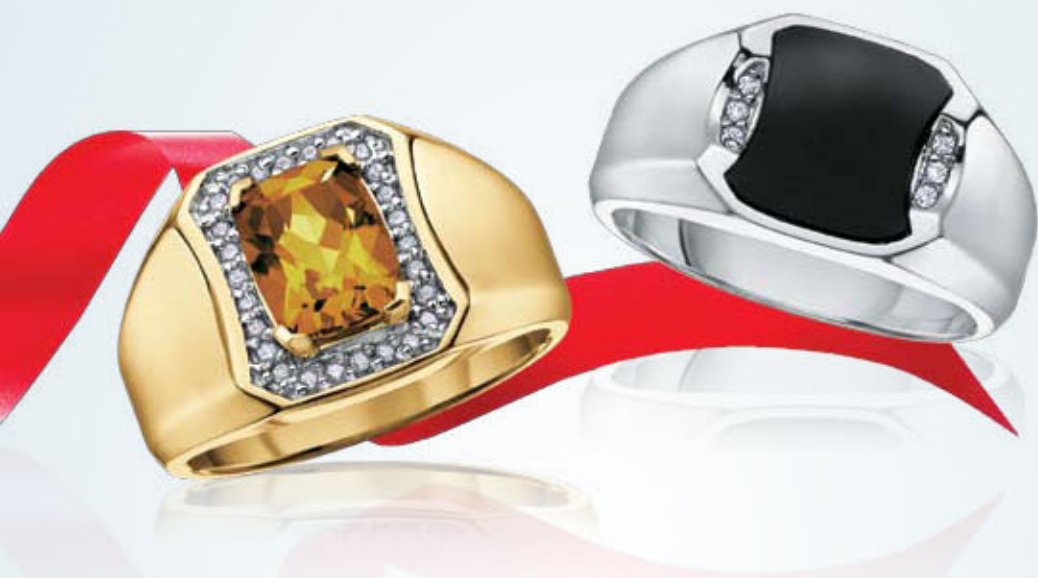
BEER QUARTZ DD 2161** $599