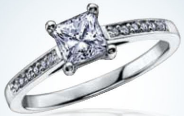
PwBk DX 452 0.31ct $749 0.46ct $1,299 0.56ct $1,949