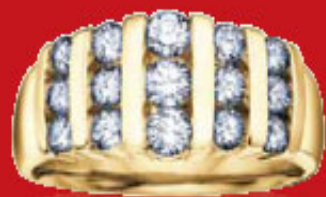
14Kt DX317 0.75ct $1,049 1.00ct $1,399