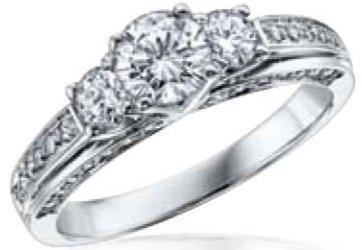
PwBk 1.00ct. DX 451 $2,299