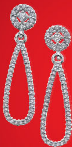
14Kt 0.75ct. DX 444 $999