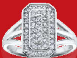
0.25ct. DX 464 $399