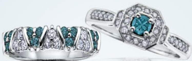
0.40 ct. DD 2138 $399