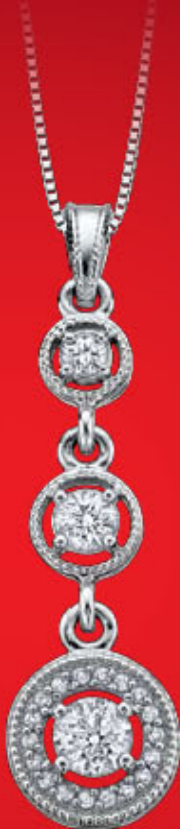
14Kt 1.00ct. DX 449 $1,999