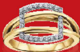
0.15ct. DD 2149 $299