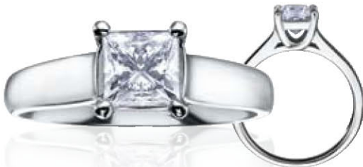
PwBk DX 450 0.40ct $1,399 0.70ct $3,299 0.50ct $1,999 1.00ct $5,499 INDEPENDENTLY APPRAISED