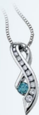
14 Kt 0.33 ct. DD 2064 $499