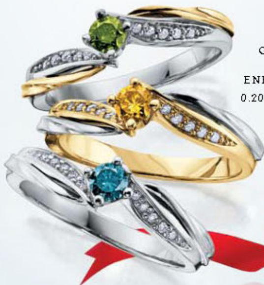
GREEN, YELLOW & BLUE COLOUR ENHANCED DIAMONDS 0.20 ct. DX 455 $349ea