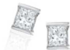
14Kt DX 123 0.10ct $169 0.14ct $199 0.20ct $299 0.25ct $379 0.33ct $499 0.50ct $899