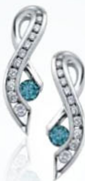
14Kt 0.35 ct. DD 2120 $399