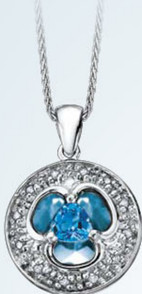
BLUE TOPAZ DD 2127 $499