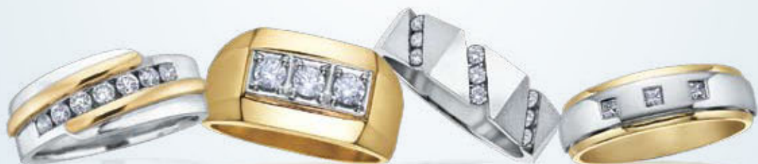
0.50ct. DD 1859* $949