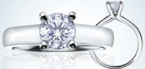
PwBk DX 312 0.33ct $999 0.50ct $1,799 0.40ct $1,299 0.70ct $2,799 INDEPENDENTLY APPRAISED