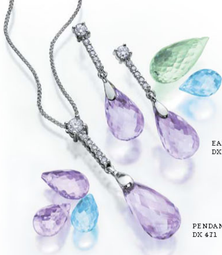
EARRINGS DX 470